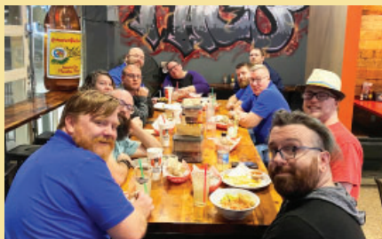
The Brethren of Mizpah Lodge #302 showing what the reality of Masonry looks like.

In the past, I've written about Annual Communication as an example of the illusion of Masonry versus the reality of Masonry. I've written about how the rich food, the pageantry, the laughter and new friendships give way to a sometimes dreary Lodge reality of greasy fried chicken in the basement on paper plates, while we argue over a $23 can of paint or the