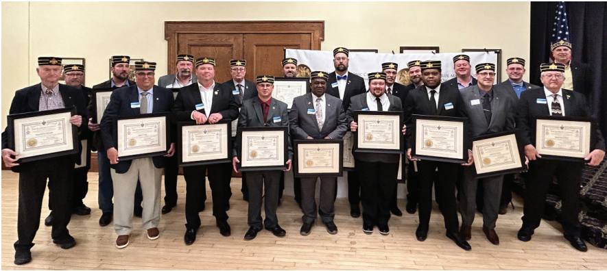
19 Brethren got their 32° Caps and Patents at the February Dinner