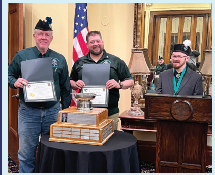
Knights of St. Andrew Dennis P. Samuelson Service Award

Each year, the Omaha Knights of St. Andrew present the Dennis P. Samuelson Service Award each year to a Scottish Rite Brother (or Brothers) who have consistently demonstrated the spirit of service and leadership within the Scottish Rite.