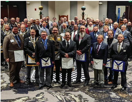
Annual Communication at the Younes Conference Center, Kearney, Nebraska

Masons often get frustrated with the mechanics of Freemasonry, arcane procedures and occasional bureaucracy, Brothers who resist change (or are pushing for change). But for me, Annual