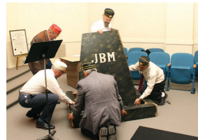
I appreciate all the Brethren who pitch in at Reunions and events!

I hope to have Candidates for a Fall Reunion, and I'll get the word out when a date has been decided upon. Please make time for Reunions when you can. We always need help with the stage crew and with Degree work. And of course, we need Brethren to sit on the sidelines and help welcome new 32° Scottish Rite Masons. Alliance may be a small Valley, but we have a lot of fun at our Reunions, and I'll stack our members and our Valley as the equal of any other!