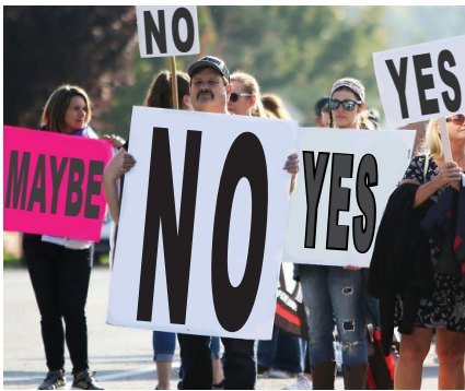
The post-Covid world has left society more polarized than ever. This is the opportunity for us to promote Freemasonry as the place "to dwell in harmony."

M uch has been written about the Covid-19 pandemic, and I am sure plenty more has yet to be written. The pandemic accelerated trends that were already happening. We went from the dream of working from home to the reality of remote workplaces. Many people who could work remotely have moved to smaller, more affordable towns, away from the urban centers. People seem to prefer shopping from home or watching a movie on an on-demand service rather going out like we used to.