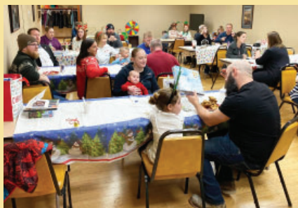
A Lodge hosted a Christmas party, with many families attending. The Lodge is a place of community, not just where Masons meet.

Some Lodges offer book clubs for members or a book club specifically for their ladies. Other Lodges arrange