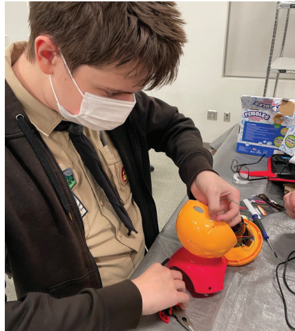
Boy Scouts help adapt toys for children with disabilities