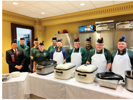
Knights of St. Andrew serving breakfast