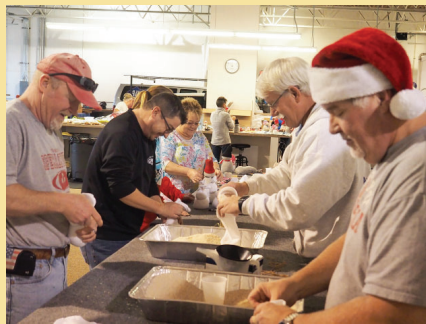
Engaged and Active: the members of Lancaster #54 and Hickman #256 prepare stockings for the Masonic Home

This is the point I find most interesting. Most every man possesses the latent abilities that Masons prize, and by being engaged and active, those skills are developed, honed, and refined. It comes down to those of us who have