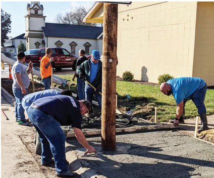
Leadership isn’t necessarily presiding over a meeting. It can be stepping up to replace the sidewalk in front of the Lodge, as the Brethren from Bellevue Lodge #325 are doing.

I am not making light of the statement that Freemasonry teaches public speaking. Quite the reverse. While Freemasonry does not instruct men in the fundamentals of public speaking, the fraternity does encourage a member to develop and master his own abilities to inform, persuade, motivate, debate, and speak on either a formal or impromptu basis.