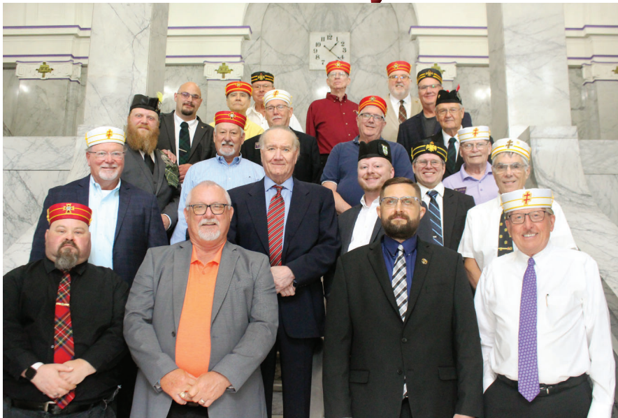
Valley of Lincoln Scottish Rite Summer Reunion June 24 th and 25 th , 2022