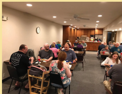
Centennial Lodge #326 welcomes a good crowd for the fish fry friendship night this past June

Now let's be honest here. We know that Freemasonry will never have the membership resurgence as we did in the 1950s. Membership will always be a