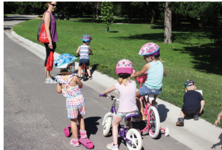
Some of the RiteCare kids rode bikes around the trail at Pioneer Park