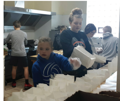
With school out, kids are helping to pack lunches

The Scottish Rite will continue to host our Community Table free lunches. However, instead of opening up the dining room, we are handing out free sack lunches at the door. The volunteers are taking care of disinfectant procedures and following Center for Disease