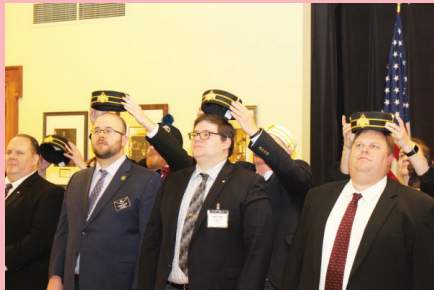
Capping ceremony for our newest 32° Scottish Rite Brethren

"Ladies Night at the 'Rite" has been a tradition at the Scottish Rite for going on twenty years, and is an evening not worth missing. Mark your calendar for next February, and join us as we celebrate the ladies in our lives!