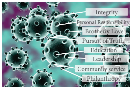
The anatomy of a Freemason. Make it viral.

All this uncertainty got me thinking about our Masonic fraternity. We've endured anti-Masonic fervor during the Morgan Affair and we've seen Brother set upon Brother during too many wars. We've seen our Masonic Lodges decimated by the Great Depression, and we