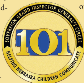
The SGIG's Circle challenge coin