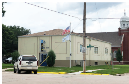
Above: Members enjoyed a great dinner and learn about Scottish Rite philanthropies. Below: Blazing Star Lodge #200

own Teachers of the Year award through the Hastings Foundation. After the Scottish Rite program in the dining room, members were welcomed to Blazing Star Lodge #200 for the monthly communication.