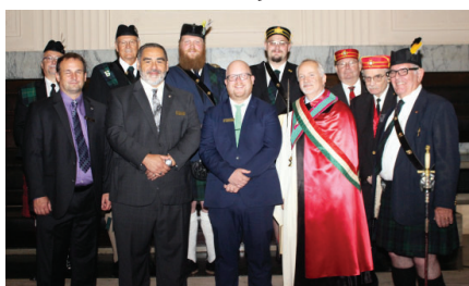
Candidates with the Knights of St. Andrew after the 29th Degree on Saturday