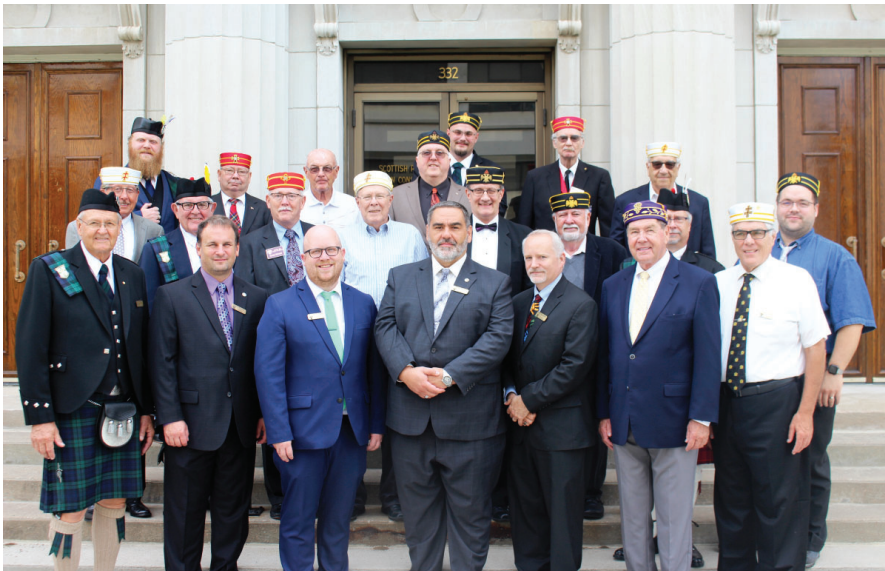
Valley of Lincoln Summer Reunion