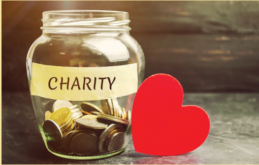
For eligible Brethren, please consider a year-end distribution from your IRA

A Brother recently called me to tell me he had November 2 marked on his calendar. That's the day he turns 70 1/2. More importantly, that is when he becomes eligible to contribute