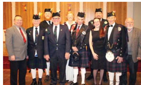
The Knights of St. Andrew hosted the evening.