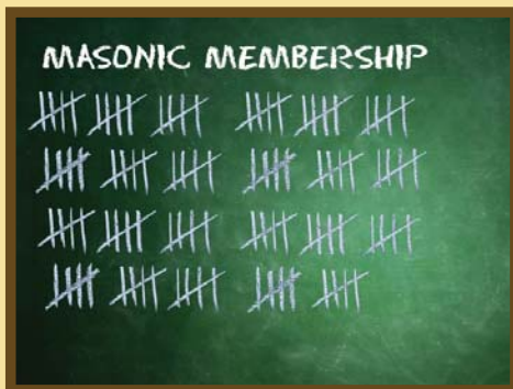
Masonic membership: it should be more than just a number or tick-marks on a chalkboard

His article could well be written about Freemasonry! It is easy to get discouraged when you look at the declining numbers. But basing assumptions off the head-count creates a negative impression that