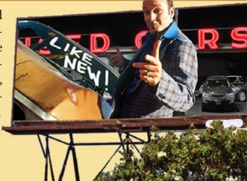
Is this the kind of in-your-face promotion we really want for Freemasonry?

To an extent, we have. E-mails, FreemasonNetwork.org, SR Chirp, Facebook, Twitter, and social media give us numerous opportunities to communicate in