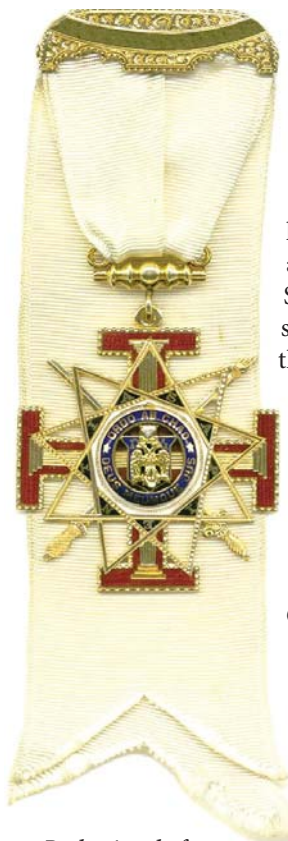
Pocket jewel of a 33° Inspector General

Every two years, the Supreme Council of the Scottish Rite votes to confer the highest honors on a small number of Scottish Rite Masons, recognizing their service and leadership within the fraternity.