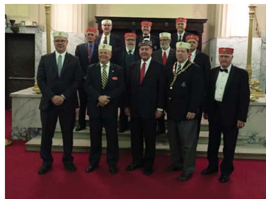
Hastings brethren in Lincoln for the KCCH conferral on Friday, October 23, 2015.