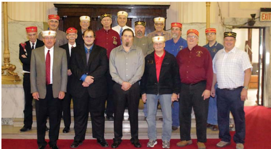
Congratulations to our new brethren in the Lincoln Fall 2015 Reunion November 6-7, 2015