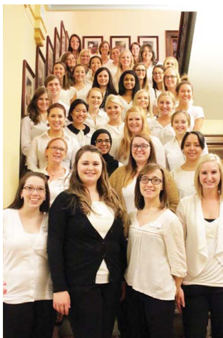
Thanks to the members of NSSLHA for supporting the Friends Dinner each year!