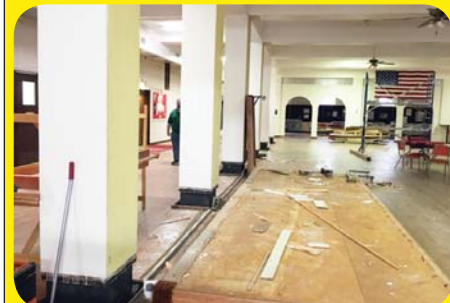
Construction work begins in the ballroom