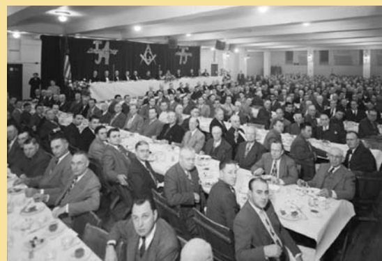
Banquet in Lincoln Scottish Rite ballroom, 1949

But think about the men you aren't seeing in those class photos - the 100 or more Brethren it took just to do the Degree work, and the men behind the scenes on the stage, in the costume room, or setting up the stage and drops Degrees. It was truly a REUNION - whether Brethren were active Scottish Rite Masons or only came back once or twice a year for those degrees, they came back, caught up with old friends, made new