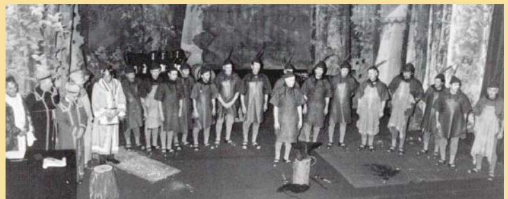
22° Degree Team, Valley of Omaha, circa 1960s

Just look at those old Reunion programs with all the degrees we haven't done in years. Perhaps you were in one of those classes or degrees!