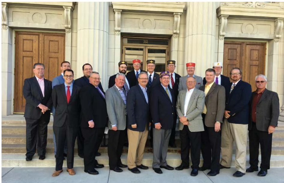
Congratulations to the 11 new 32° Scottish Rite Masons from the October Reunion