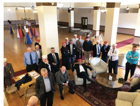
How do you get Masons to stand still for a picture? Put on the Nebraska football game!