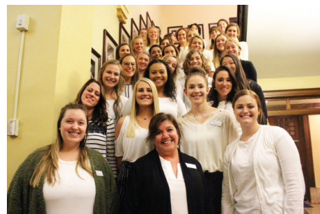
Nebraska Student Speech-Language Hearing Association (NSSLHA) volunteered throughout the evening