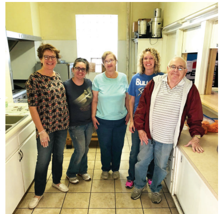
Some of the Community Table volunteers at the Alliance Scottish Rite

The Scottish Rite building has also played host to Community Table. On the first day, we served six people, and it has increased every day. On non-school days, we serve sixty people, with at least 40 on other days. We have volunteers from all around Box Butte County, and food and donors from local businesses. This really shows both the need