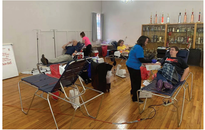
On November 13 th , Alliance Lodge #183 hosted a blood drive welcoming a decent crowd between 8 and noon.